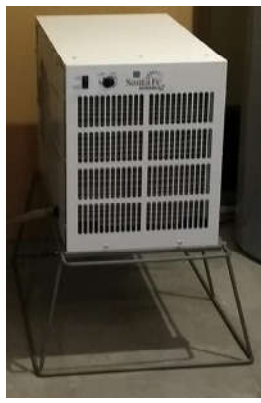
Dehumidifier Stand Easy to drain