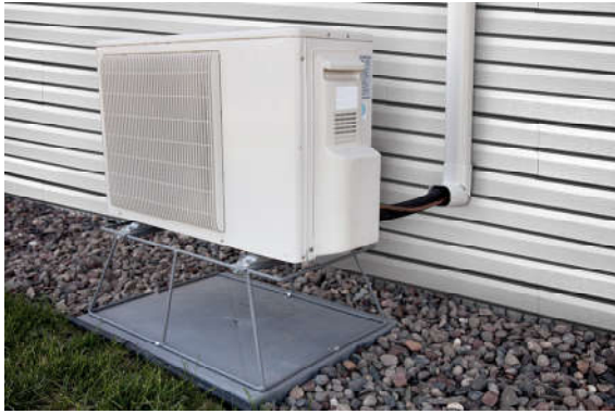
Mini Split Stand