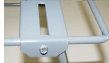
Adjustable top plate